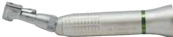
16:1 Standard Contra Angle - included